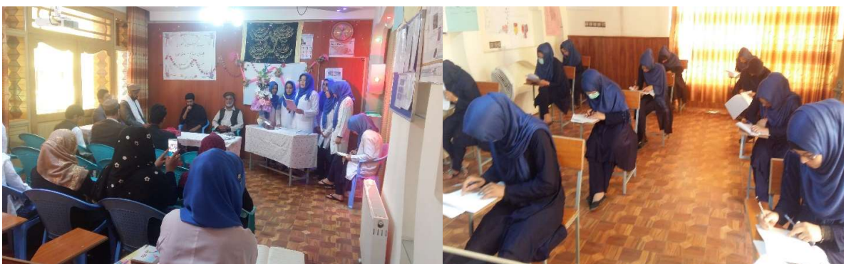
ORCD-Ghazni - CME School first semester exam (right) and Ceremony of 1 st Semester Completion (left)