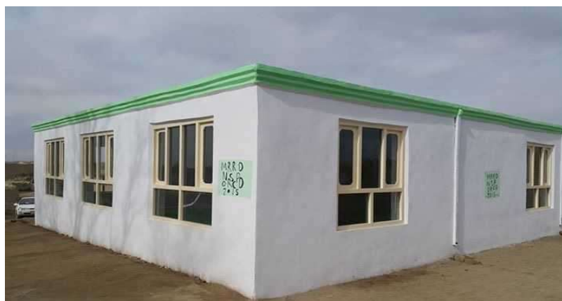
Photo (left): Community Center constructed by Porta Chamri CDC in Janikhel district of Paktika province. The total cost of construction reach AFN 1,617,693 out of which AFN 181,000 was contributed by the community through in cash payments and/or in-kind contributions

Photo (right): Community Center built by Community Development Council of Khadikhel village in Janikhel district of Paktika province with a total cost of AFN 1,540,162 out of which AFN 155,000 was contributed by the community in cash payments and/or in-kind through physical work or other in-kind contributions