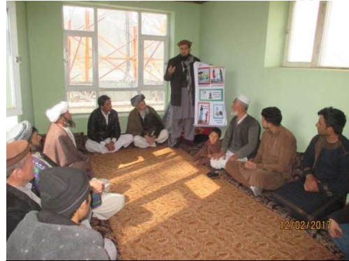
Community Awareness on Hygiene

The direct beneficiaries of this project are GBV survivors, perpetrators, religious leaders, community elders, youth, boys, girls, men and women of host and displaced communities.