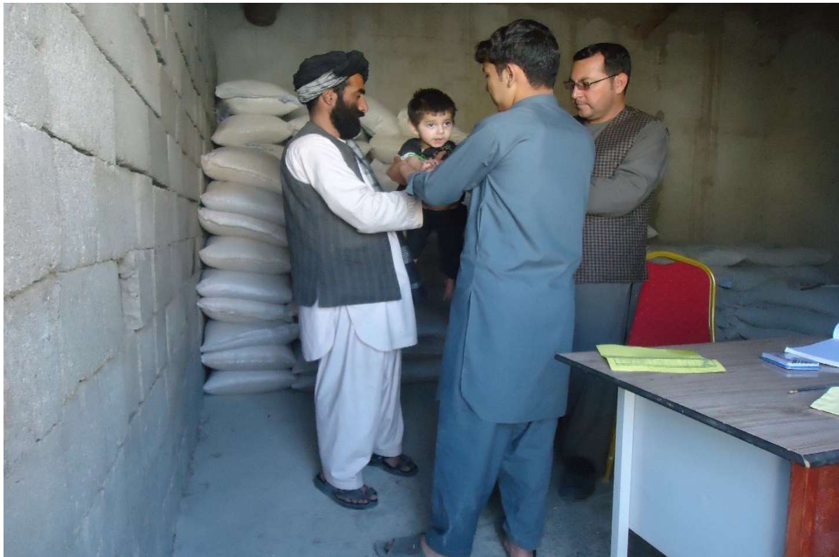
ORCD Nutrition Officer and Distributor seeing and recording a malnourished boy followed by distribution of supplementary food in the distribution point

Moreover, WFP's Project Assistance Team undertook several surprise monitoring visits from ORCD's warehouses, distribution points and distribution processes. Therefore, ORCD developed follow-up action plans in the view of WFP/PAT findings subsequent to receiving reports on findings/areas for improvement. The follow-up action plans were implemented timely and the results were communicated to WFP Kabul Area Office subsequently.