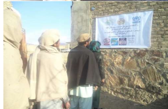
Winter assistance distribution to Refugees