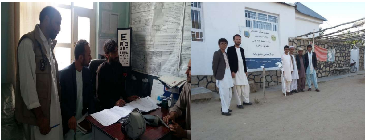
ORCD and GCMU’s Senior Staff during a Supervision Mission visiting Health Facilities in Ghazni

The primary target population of this project are pregnant women and children under five years of age. Though, the entire population in the target areas is able to receive basic health services through Health Posts, SHCs, Prison Health Center, BHCs, CHCs and CHC+.