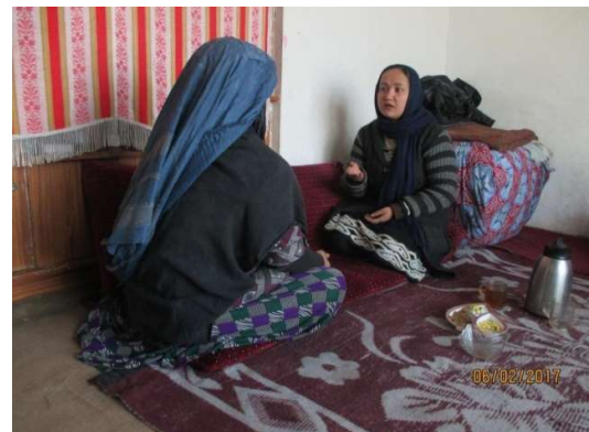
Photo: ORCD Mobile Team Psychosocial Counselor providing psychosocial counseling/support to a GBV survivor in an IDP community in one of the villages of Baghlan province.

Through follow-up visits, it was acknowledged that the survivor was getting relieved.